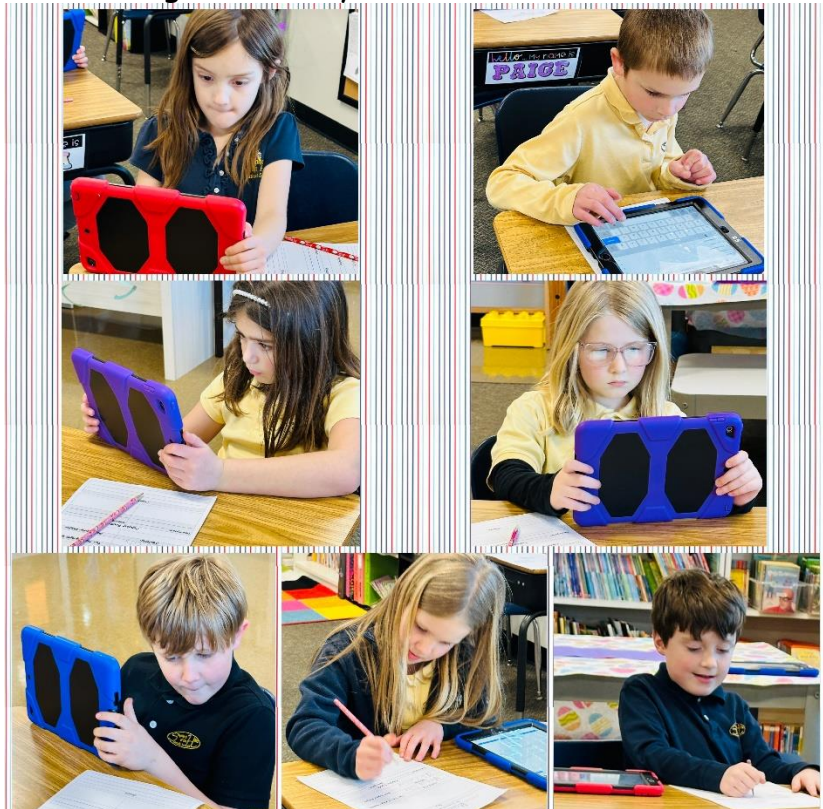
Researching different cultures in social studies class