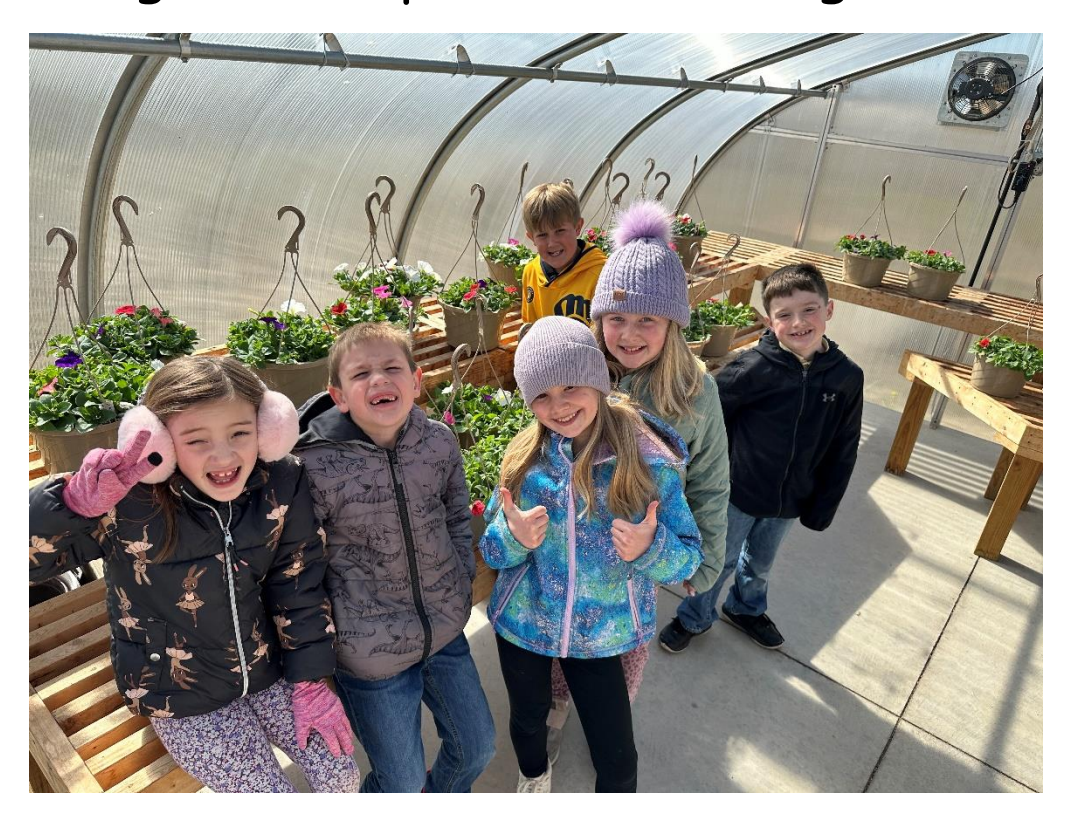
Cheeto Pollination Activity